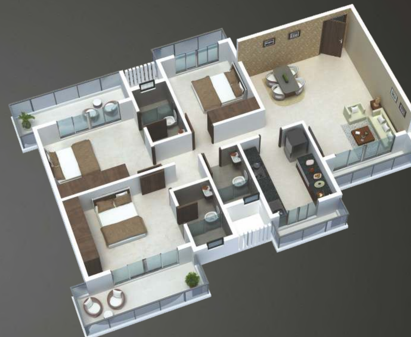
3BHK 3D Plan