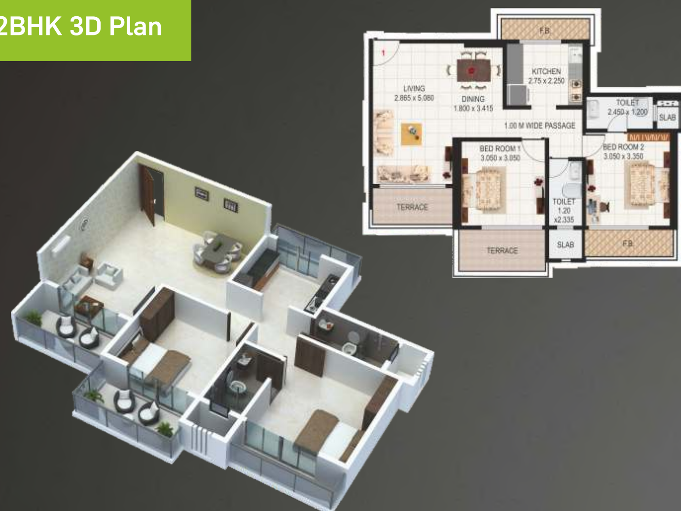
2BHK 3D Plan